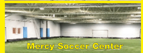
Mercy Soccer Center

Convenient Bus Transportation Available!