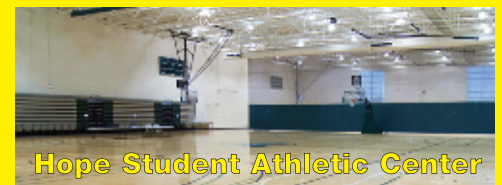
Hope Student Athletic Center

Hi-Five has exclusive use of these state-of-the-art indoor facilities during inclement weather for soccer, football, baseball, basketball and more!